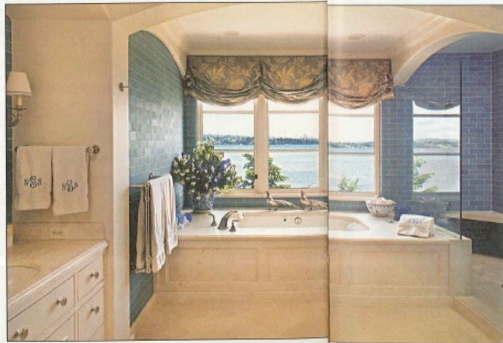
The master bathroom is sheathed in beautiful blue glass tile made by Cultus Bay Glass Studio on Whidbey Island.