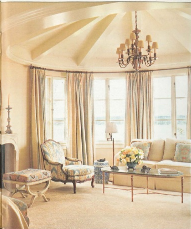
In the master bedroom, both the bed and the sitting area are oriented for enjoyment of the constantly changing view of water and sky.