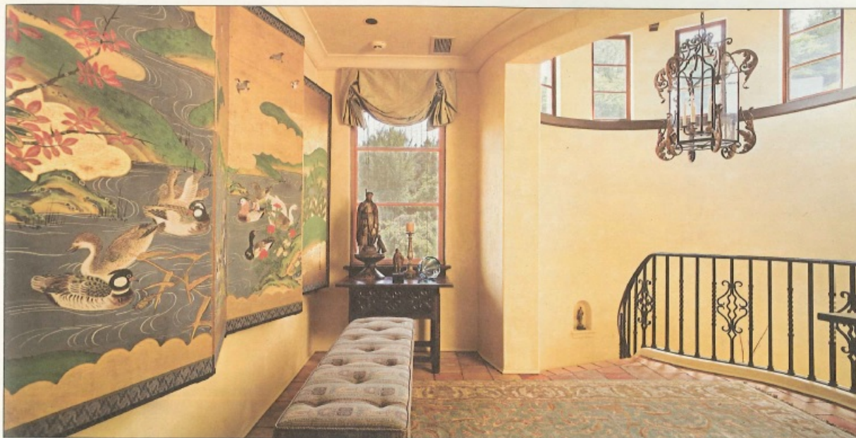
The second-floor landing is the perfect location for a Japanese folding landscape screen depicting autumn.

HARDWOOD FLOORING: Hardwood Specialties, Inc., Dan Cauffman