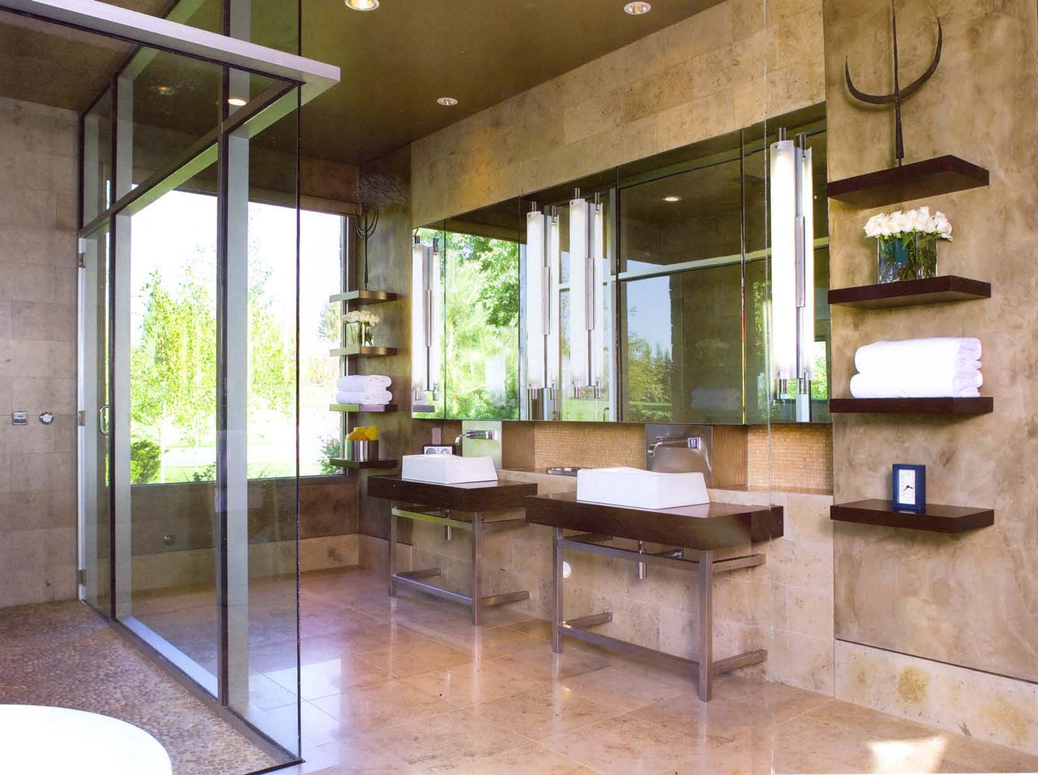
Above: Wenge wood vanities and shelving help to enliven the neutral, almost spartan look of the bathroom. They also contrast the sleek, semi-industrial look of the square-edged stainless steel vanity supports and shower framing.